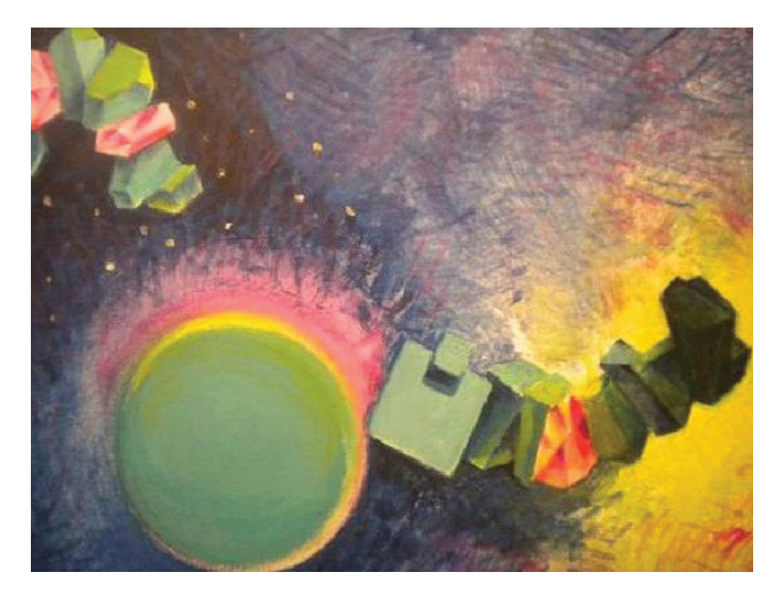
Figure: The picture drawn by one of the patients who is a painter illustrating his visual experiences during phacoemulsification with anterior chamber maintaner under topical anesthesia.

One of the patients was a painter and voluntarily drew the picture of what he had seen during the surgery (Figure). None of the patients had any complication postoperatively due to ACM use.